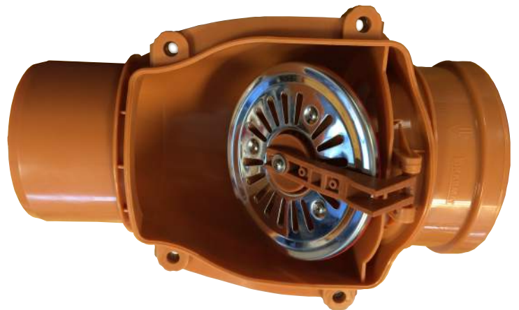
NRV-110 (Non-Return Valve 110mm) NRV-160 (Non-Return Valve 160mm)

110mm & 160mm NRV's are available for next day delivery.